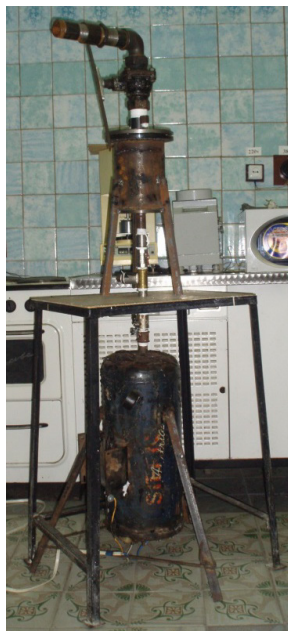
Fig. 1. Experimental apparatus for studying thermal processing influence on the sunroot surface layer

heating at steam generation air must be preliminary ejected from the steam generator. Steam supply in the working chamber from the steam generator is realized through the branch 4 at the open tap 12. For keeping the necessary level of water the steam generator is connected to the central water supply system. At the tap opening water is supplied inside the steam generator through the branch. At safety measures observance the regulation of the water level in the steam generator must be realized only when the pressure in it is equal to the atmospheric one.