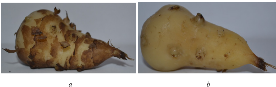
Fig. 3. Sunroot samples at the combined cleaning process:

On the Fig. 3 are presented the sunroot samples that underwent the preliminary thermal processing by steam and the ones that underwent the further mechanical additional cleaning.