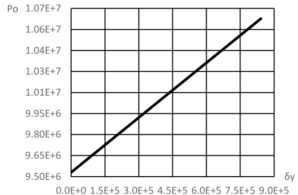
Fig. 3. Dependence of profits on internal investment of "PivdHZK"

Analysis of the graph in Fig. 3 shows that growth of internal investment of "PivdHZK" results in its increased profits. Visual linear positive growth is indicative of the suggested analytical analysis viability.