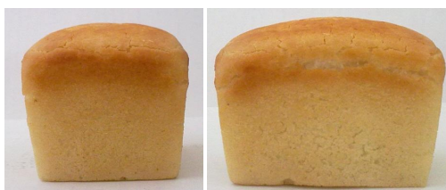
Fig. 1. Outlook of the experimental sample of formed protein-free bread from two sides

Photos of crumb of bread, baked with adding microbial polysaccharides are presented on Fig. 2 . The photos are made by the method of microscoping at 10 times magnification.